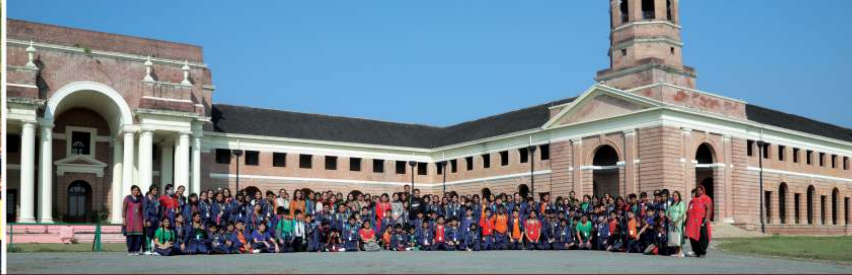
FRI DEHRADUN VISIT