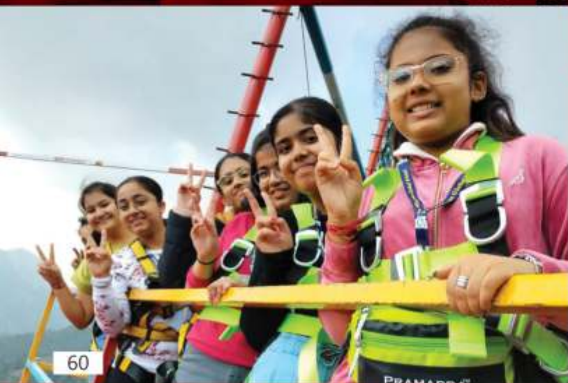
TRIP TO KANATAL