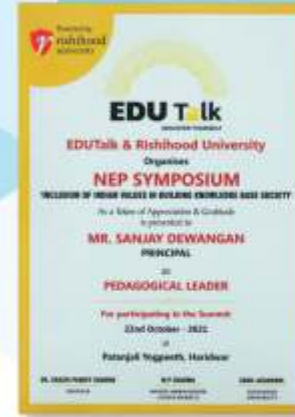
Pedagogical Leader Award