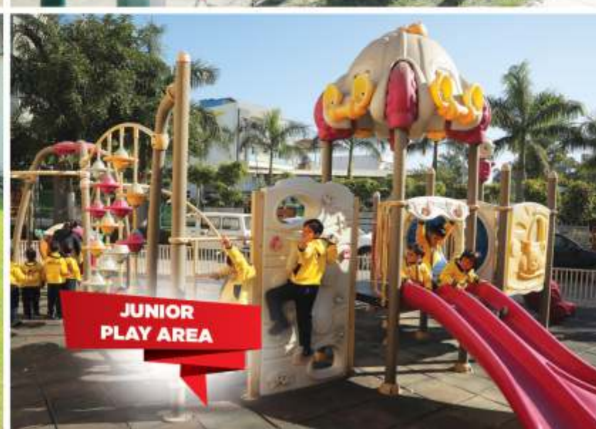
JUNIOR PLAY AREA