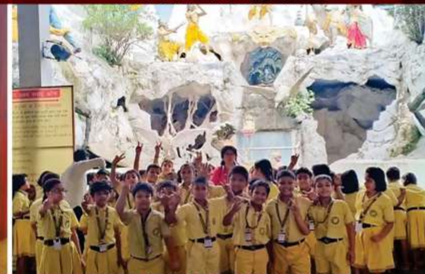
BHARAT MATA MANDIR VISIT