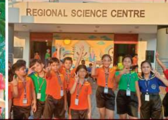
TRIP TO REGIONAL SCIENCE CENTRE