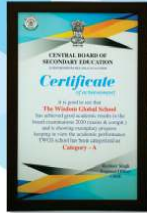
CBSE Certificate Top Category Award "A"

The Wisdom Global School is proud to have achieved an extremely high reputation and have earned equally high goodwill to be treated as one of the most premium schools of Uttarakhand. We are delighted to present here some of the national and international organizations who have been kind enough to appreciate our efforts and present us with their prestigious awards and recognitions. We can never thank our teachers, management, parents, and students enough who have been part of our short journey till now for facilitating us in achieving such milestones.