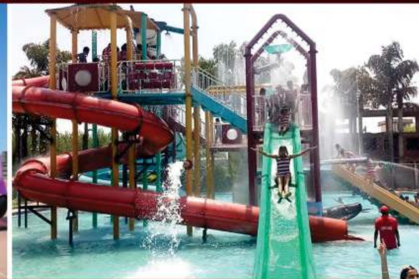
CRYSTAL WORLD VISIT