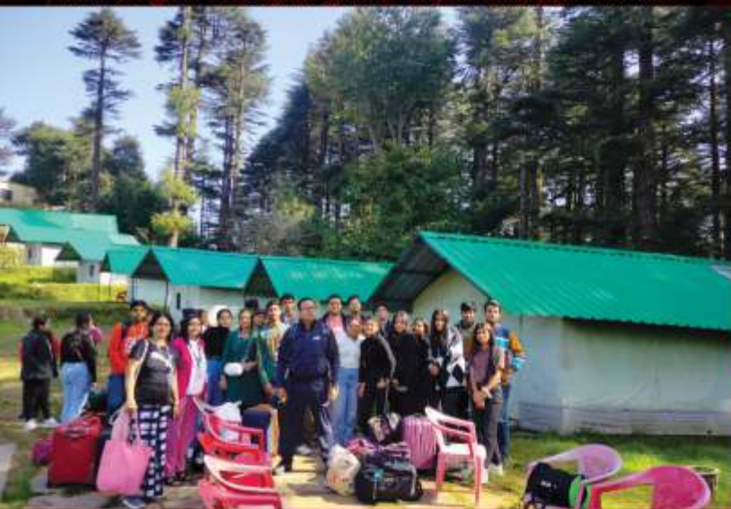
TRIP TO KANATAL