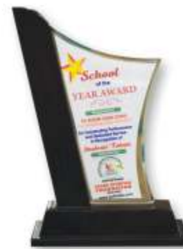
Star School of the Year Award