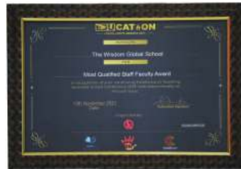
Most Qualified Faculty Award