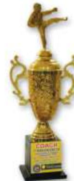
Best Taekwondo Coach Award