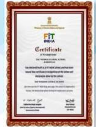
FIT India Award