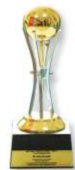
Best School Olympiad Award