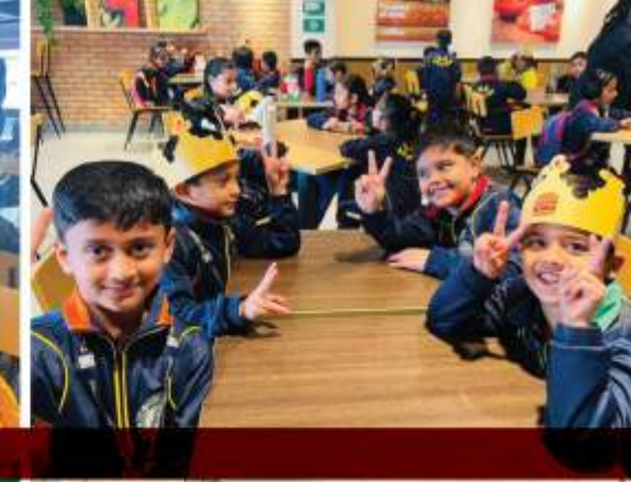
TRIP TO BURGER KING