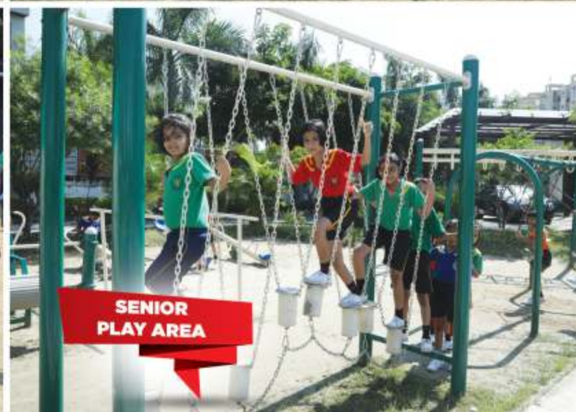
SENIOR PLAY AREA