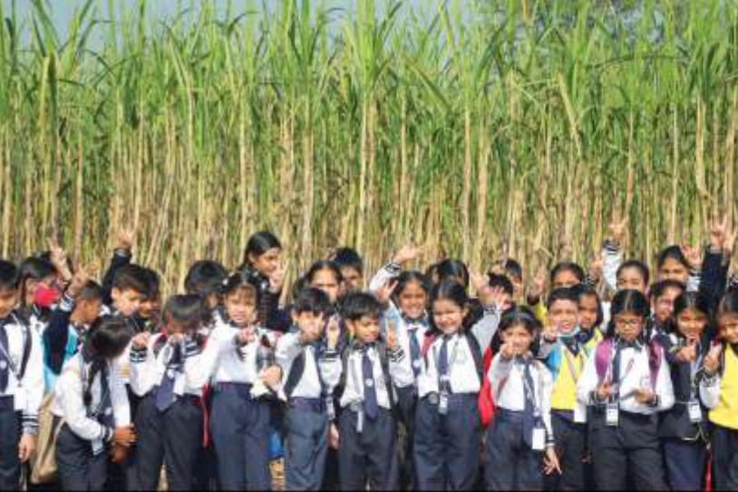
VILLAGE VISIT TO UNDERSTAND JAGGERY MANUFACTURING