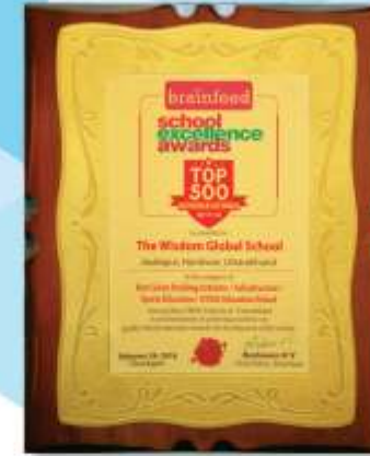
School Excellence Award