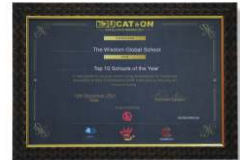
Top School Award