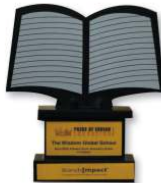
Pride of Indian Education Award