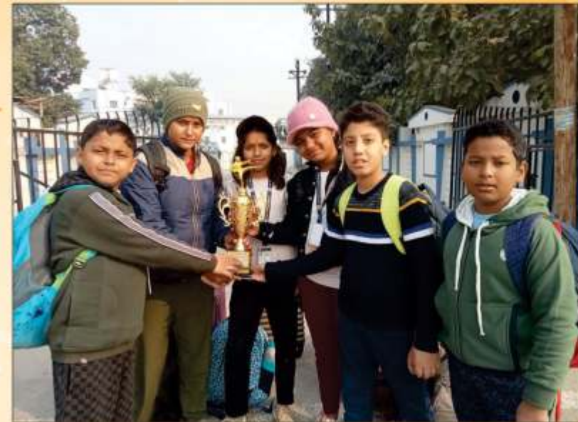
5 students secured one Gold, two Silver and two Bronze Medals in 3rd Kashi Challenge Cup in the category of Taekwondo.