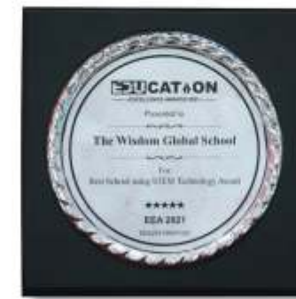
Best STEM School Award